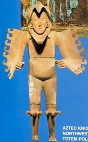
AZTEC KNIGHT CARVING; NORTHWEST COAST TOTEM POLE